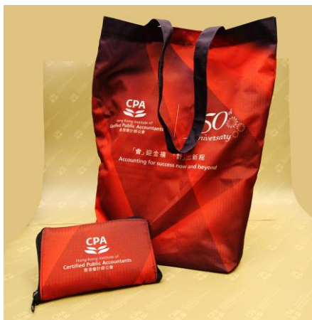
Tote Bag (code: 50THANN02) HK$48