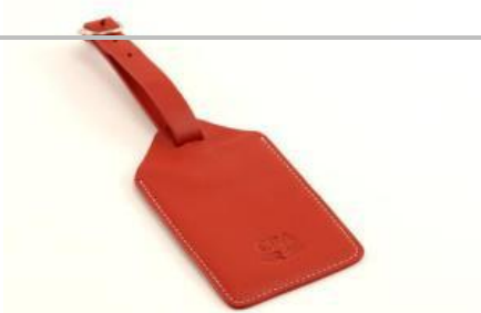
Luggage Tag (Red)