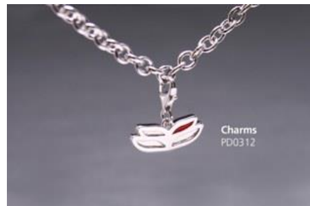
Wings (code: PD0312) HK$100