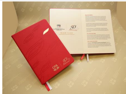
A5 Note Book (code: 50THANN04) HK$88