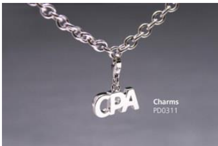
CPA (code: PD0311) HK$100