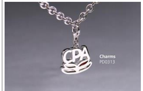
CPA + Wings (code: PD0313) HK$120