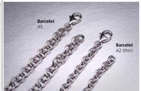
Bracelet (code:A5) HK$100