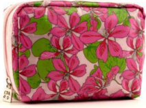
Cosmetic Bag (Pink)