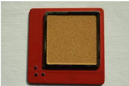
Coaster (Red) (code: C16R)