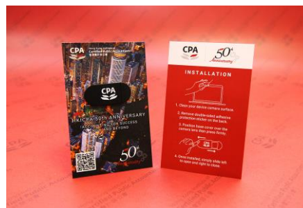
Webcam Cover (code: 50THANN03) HK$15