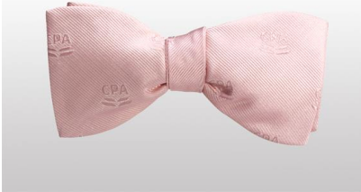
Bow Tie (code: BT01P) HK$200