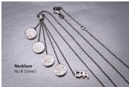
Necklace (code: NL-B) Length: 29 cm HK$350