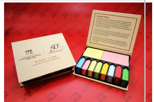
Post-it (code: 50THANN05) HK$38