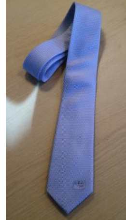
Silk Necktie (Purple) (code: TSP14S) Style: Slim HK$120