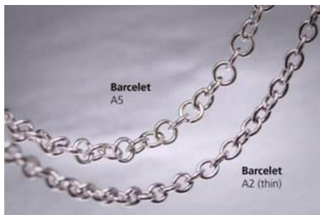
Bracelet (thin) (code: A2) HK$100