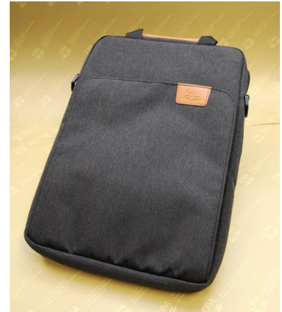
Tablet Bag (code: 50THANN06) HK$188