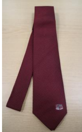
Silk Necktie (Maroon) (code: TSM16M) Size: 8.3cm x 148 cm HK$120