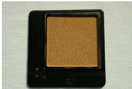
Coaster (Black) (code: C16R)