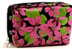
Cosmetic Bag (Black)