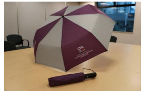
Foldable umbrella (Purple & Grey) (code: UPG01)