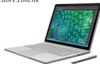
Microsoft’s Surface Book, price starts at HK$10,588

With its detachable 13.5-inch display, that doubles as a full-blown tablet, Microsoft’s first-ever laptop the Surface Book, would work well for note-takers, photo-editors and gamers. Its lightweight design at 1.5kg makes it ideal for those who tend to keep productive on business flights. Available at microsoftstore.com.hk