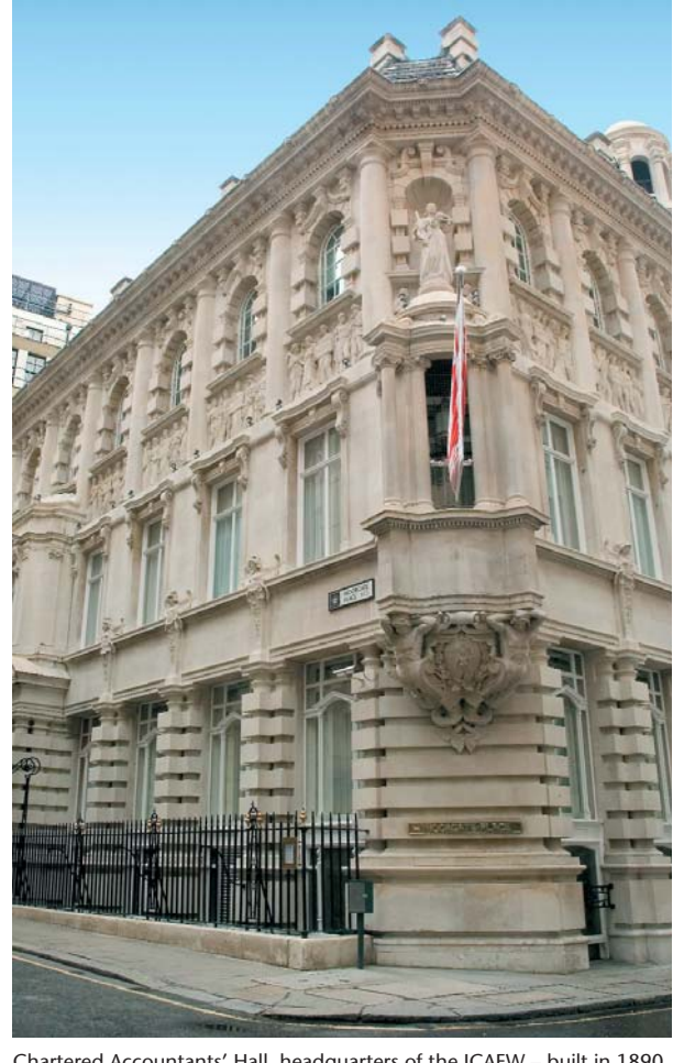
Chartered Accountants' Hall, headquarters of the ICAEW - built in 1890 by subscription of our members

Arthur Cooper 1883-1884 William Welch Deloitte 1888-1889 Edwin Waterhouse 1892-1894 Ernest Cooper 1899-1901 William Barclay Peat 1906-1908