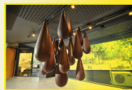
都市 · 山水 City · Landscape 李展輝 DANNY LEE CHIN-FAI 售票處 BOX OFFICE