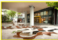
都市水景 Urban Waterscape 李展輝 DANNY LEE CHIN-FAI 正門 MAIN ENTRANCE