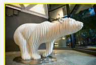
紀念碑：再進生命 (二) Monument: Reproduction of Vitalization 2 莫一新 MOIK WAI-SAN G/F