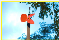
Eolus 羅塔莉 · 盧利斯特 NATHALIE DECOSTER 正門 MAIN ENTRANCE