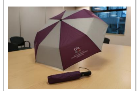
Foldable umbrella (Purple&Grey) (code: UPG01)