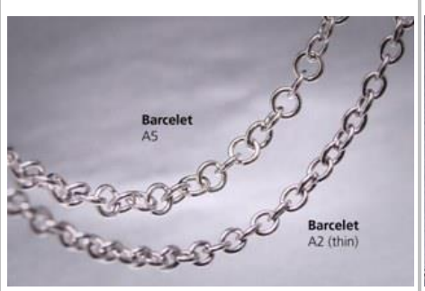
Bracelet (thin) (code: A2)