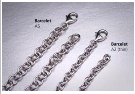
Bracelet (code:A5) HK$100