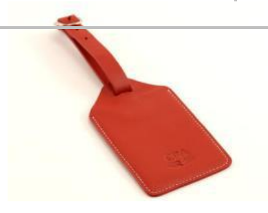
Luggage Tag (Red) (code: LT01R) HK$75