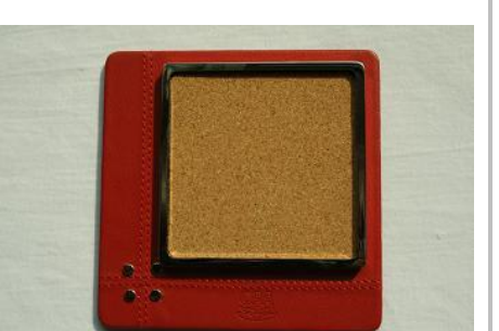
Coaster (Red) (code: C16R) HK$68