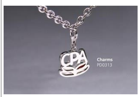
CPA + Wings (code: PD0313) HK$120