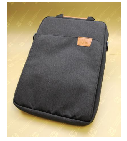
Tablet Bag (code: 50THANN06) HK$188