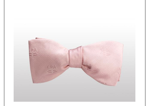
Bow Tie (code: BT01P) HK$200