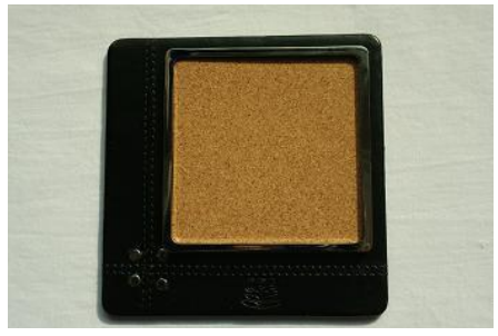
Coaster (Black) (code: C16R) HK$68