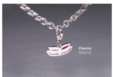
Wings (code: PD0312) HK$100