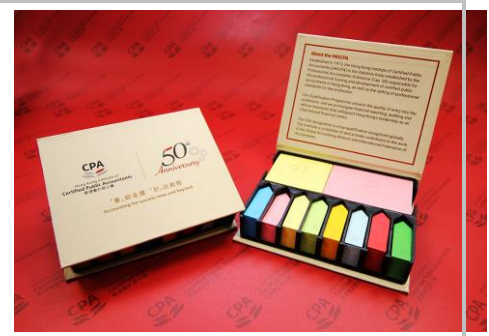
Post-it (code: 50THANN05) HK$38