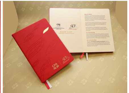
A5 Note Book (code: 50THANN04) HK$88