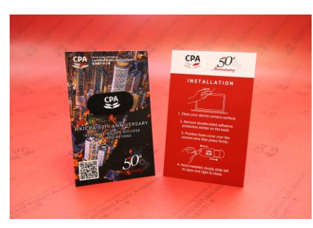
Webcam Cover (code: 50THANN03) HK$15