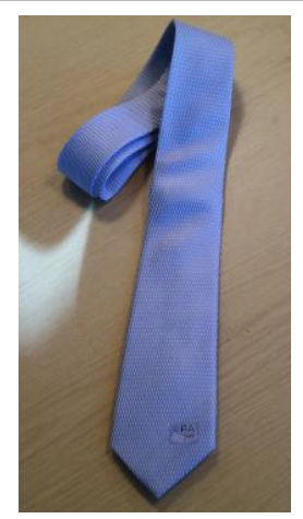
Silk Necktie (Purple) (code: TSP14S) Style: Slim HK$120