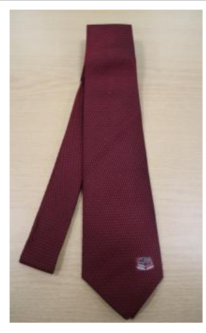
Silk Necktie (Maroon) (code: TSM16M) Size: 8.3cm x 148 cm HK$120