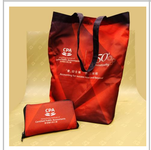
Tote Bag (code: 50THANN02) HK$48