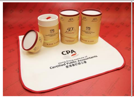
Quick-dry towel with desk organizer (code: 50THANN01) HK$48