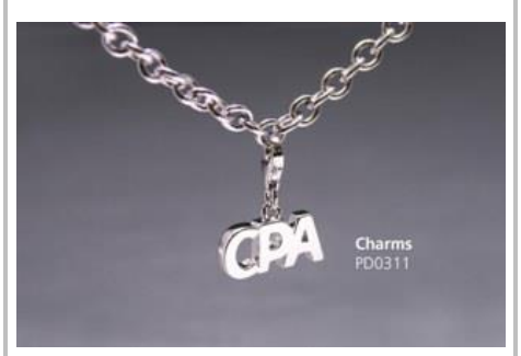
CPA (code: PD0311) HK$100