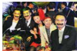
Joint professional drinks