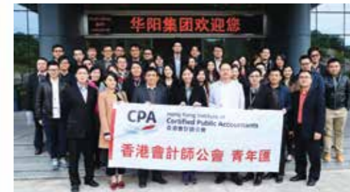
Study tour to Huizhou