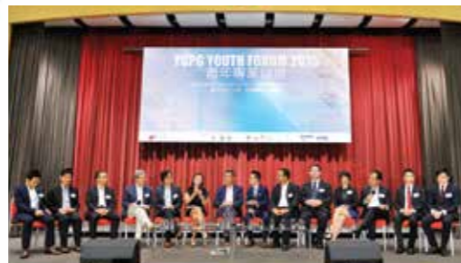
Young Coalition Professional Group's Youth Forum