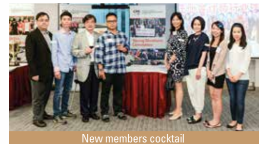
New members cocktail