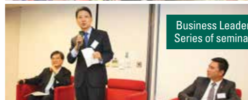
Business Leaders Series of seminars