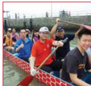
Dragon boat fun day