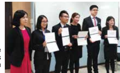
China heritage and cultural class in Guangzhou