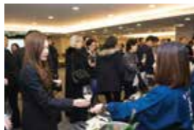
Networking with business chambers