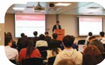
Members' forum for young members