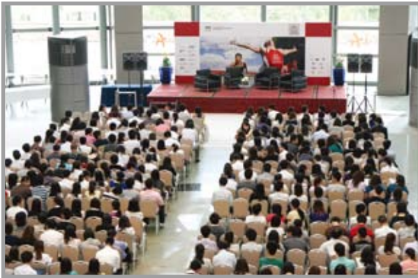
Over 500 QP and university students participated in the Career Forum 2009.