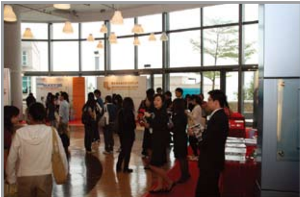
Students meeting potential employers at the career exhibition.