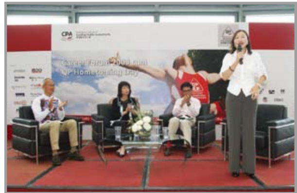
Experienced accountancy professionals shared their insights on career development of the accountancy profession with the students.