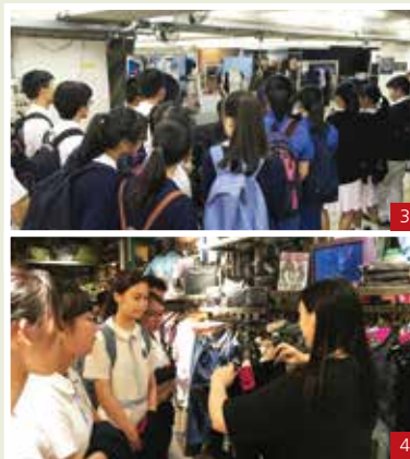
Students visiting Bauhaus' head office and its retail shop