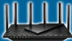
TP-Link Archer AX72 Pro

Router optimised for 2000M* broadband with 2.5Gbps port