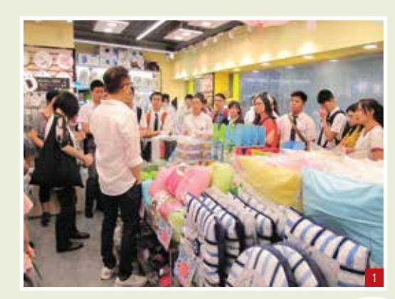
Students visiting one of the JHC concept stores

HKICPA organizes a series of activities for students during the summer. On 11 August 2016, finalist teams of the accounting and business management case competition 2015-2016 and a group of secondary school students visited International Housewares Retail Company Limited (JHC), the selected company for case study in the competition. The visit is part of the learning activities followed by the competition. In addition to a visit to the JHC's headquarter, participating students had an opportunity to join a guided tour to its concept shop and