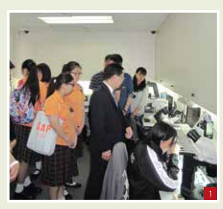
Students visiting Luk Fook and its China Gems Laboratory

HKICPA organizes a series of activities for students during the summer. On 27 July 2015, finalist teams of the accounting and business management case competition 2014-2015 and a group of secondary school students visited Luk Fook Holdings (International) Limited, the selected company for case study in the competition. The visit is part of the learning activities followed by the competition. Participating students had an opportunity to visit Lukfook's China Gems Laboratory (中華珠寶鑑定中心) and understand the business operation of a company in real life.