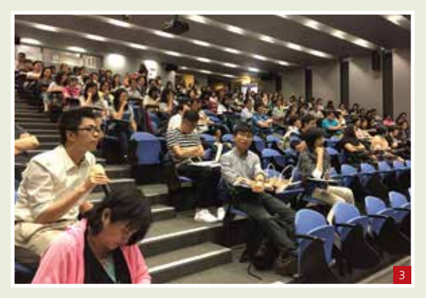
BAFS teachers joining the seminar and finding the seminar very useful for enriching their knowledge