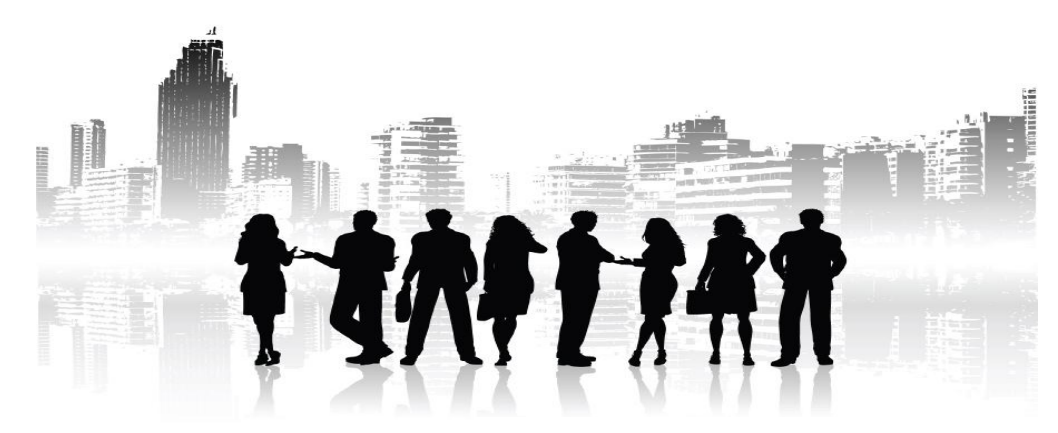
... to join us for all of these events