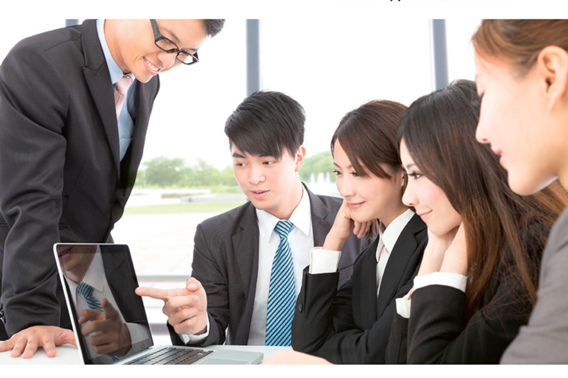
Career Opportunities at BDO

"Seniors are always happy to share their experience and happy to help me, even when they are very busy."