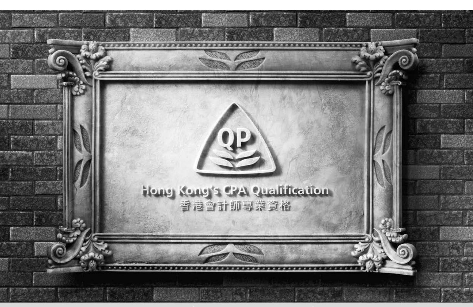
QP – 10 years of success stories and counting!