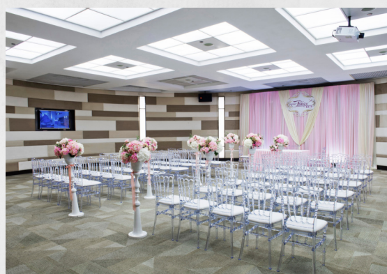
Hong Kong Parkview's Éclat Ballroom boasts soaring ceilings and iconic marble spiral staircase. The ballroom caters up to 24 tables.