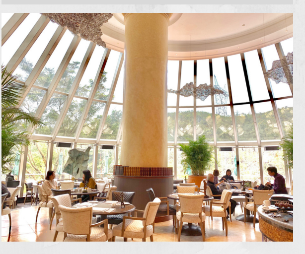
A beautiful sunlit, all-day dining venue with floor-to-celing windows, towering marble columns and elegant decor. A La Carte and set menu are available.

A sublime, authentic cantonese cuisine ranging from delicate dim sum to regional specialties.