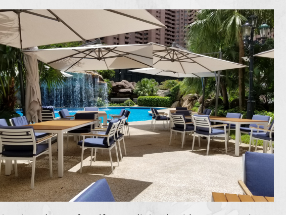
A unique haven for alfresco dining beside an expansive waterfall, featuring BBQ buffets, Tropical-Resort environment and light snacks.

fabulous bar snacks and A La minute BBQ skewers are also available to complement your drinks.